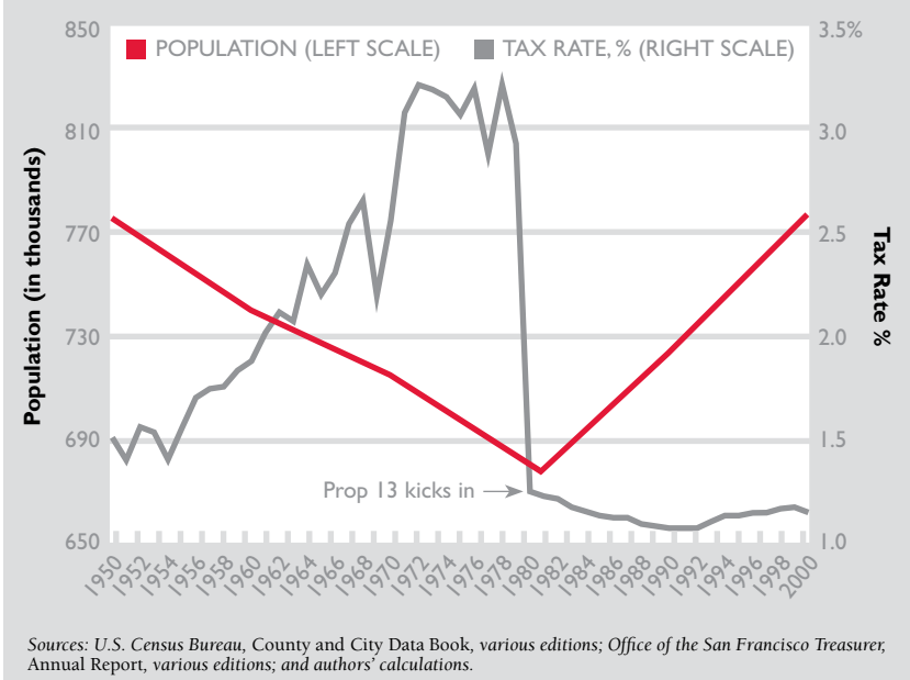
FIGURE 1 THE REPOPULATION OF SAN FRANCISCO

San Francisco provides an excellent example (though neighboring Oakland, distant Boston, and some other cities that have been forced to cut their tax rates by non-trivial amounts show similar dynamic effects). Figure 1 shows the city's steadily climbing property tax rate in the post-WWII era (right scale) and the accompanying downward trend in population (left scale). Up until the late 1970s, this record was, as we have mentioned, even worse than Baltimore's.